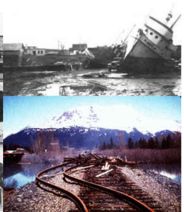
The Alaskan earthquake occurred on Good Friday, March 27, 1964, at 5:36 PM local time. It was the largest earthquake ever recorded in North America.